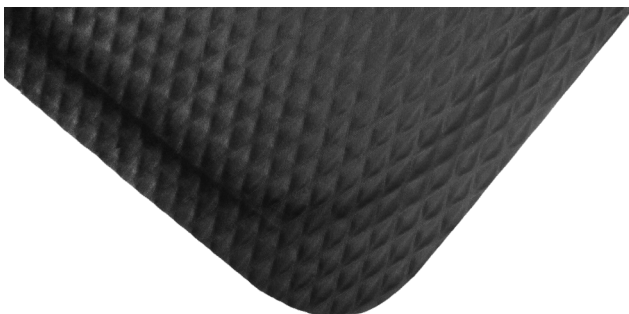
Hog Heaven with black border

Can be customized with your logo, design, or message (see Hog Heaven Impressions)